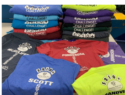
T-shirts from the 2020 5210+ Challenge. 100 schools from 10 northern Colorado school districts participated in the 2020 5210+ Challenge, representing 28,194 students, staff and families.

Our programs include the annual 5210+ Challenge ( see the 2020 winners ), 5210+ Health Heroes (registration is open!), Kindness Heroes (registration is open!), Healthy Kids/Healthy Start kindergarten education, BtrongBfit, The Healthy Kids Run Series, The Fit.Teen Run Series and the Fit Families FITPASS program.