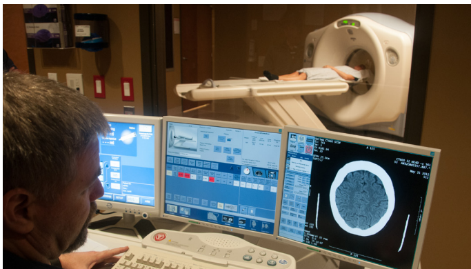
First Choice facilities include CT scanning equipment.