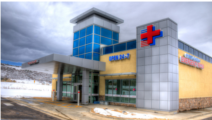
One of the First Choice facilities in the Denver area.

University of Colorado Health continued its inroads into Front Range communities last week with the announcement of a joint venture with Adeptus Health Inc. , which operates freestanding emergency facilities in Colorado and Texas.