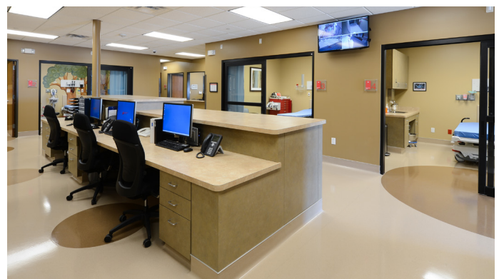
The interior of a First Choice facility.

The joint venture allows UCHealth to compete in a market already dotted with freestanding ERs. HealthOne, SCL Health, and Centura Health all have freestanding ERs that pitch their appeal to patient convenience. SCL is also building “ micro hospitals ” that it bills as neighborhood-based alternatives to traditional hospital and physician office settings.